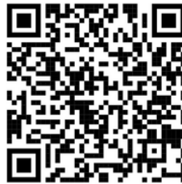
Let's Discuss: Extreme Right-Wing

Scan the QR codes to access each Let's Discuss resource.