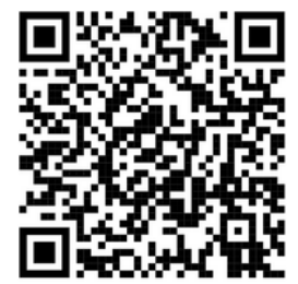
Let's Discuss: Fundamental British Values